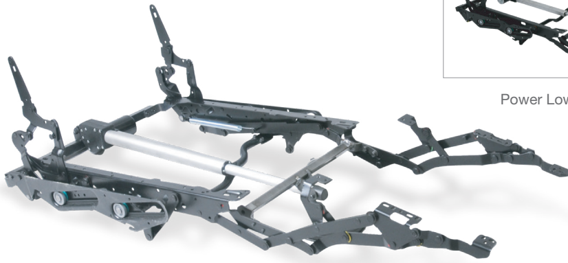
Power High-Leg (3542)