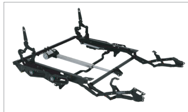
Power Low-Leg (3527)